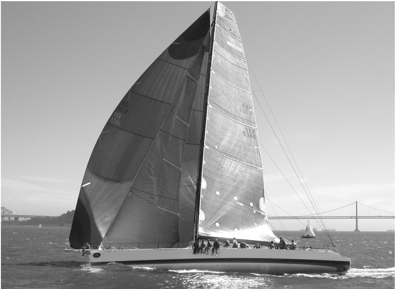
Morning Glory at the Big Boat Series 2005