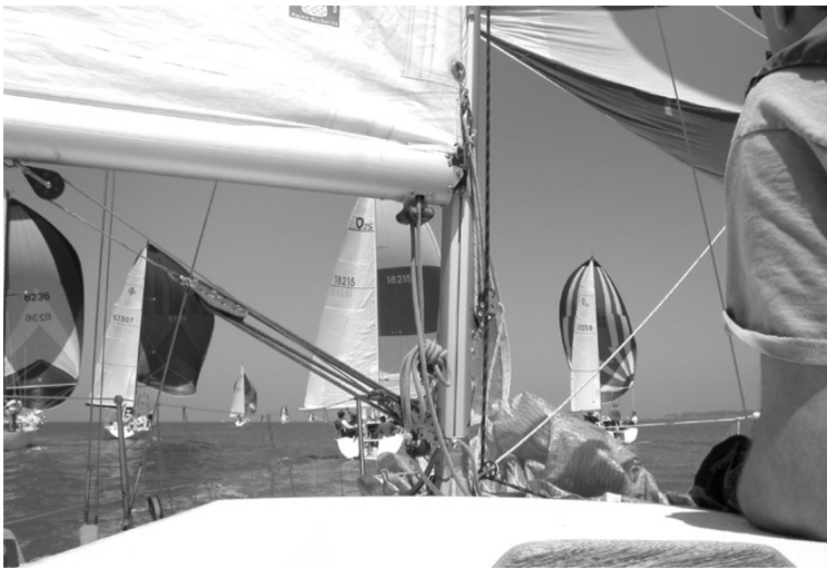
Vallejo Race 2002.