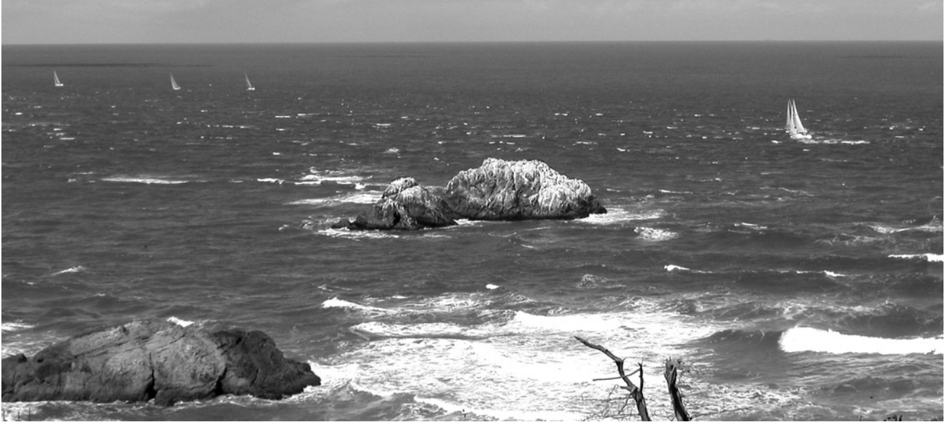
Half Moon Bay Race participants taking the corner at Seal Rocks.