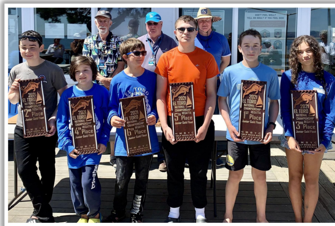
Top 6 Racers at the 2021 El Toro Regatta: Junior Division