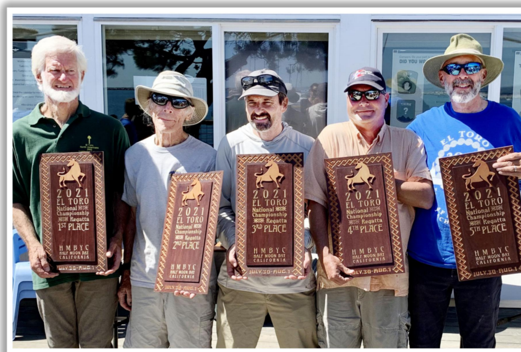
Top 5 Racers at the 2021 El Toro Regatta: Senior Division