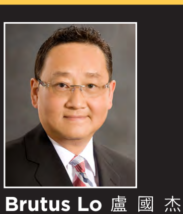
Lic# 01860887 Realtor® MBA