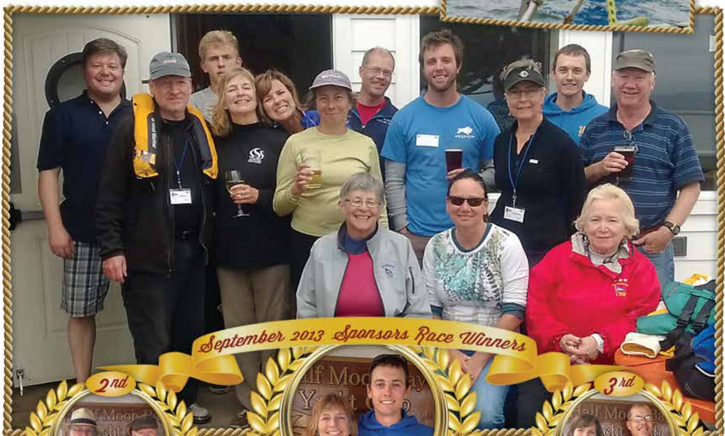
September 2013 Sponsors Race Winners