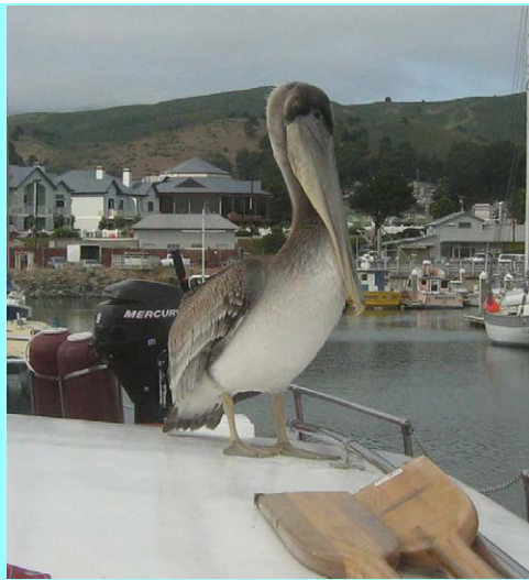
Handsome on Baroness