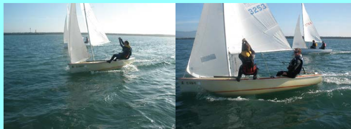
Sailing in the Harbor on January 8th, a sunny winter's day in Paradise!