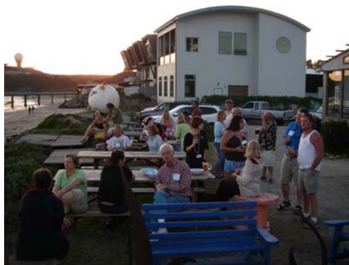
The Day After: A gorgeous, balmy Sunday afternoon at HMBYC after Commodore's Ball.