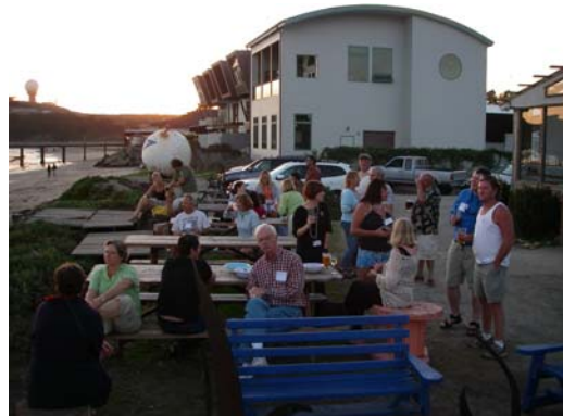
The Day After: A gorgeous, balmy Sunday afternoon at HMBYC after Commodore's Ball.