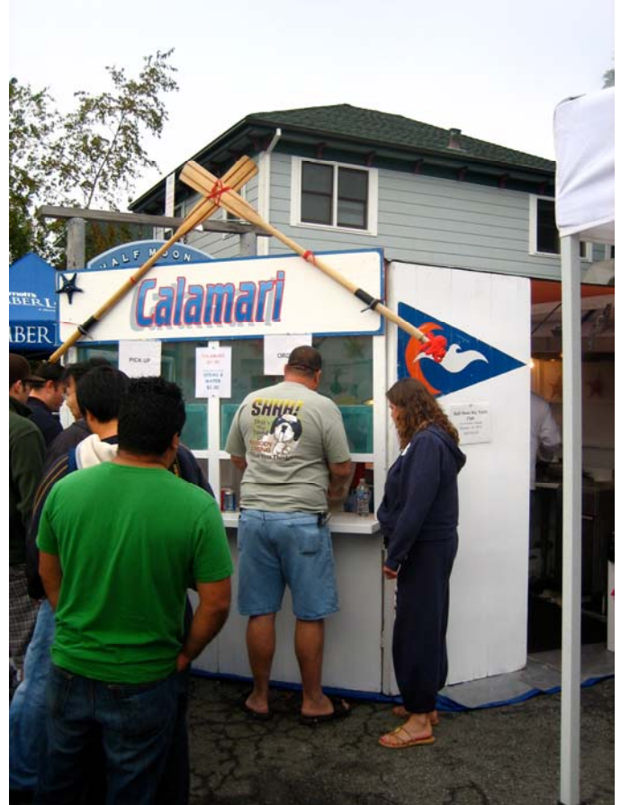
People come from all over the Bay Area, telling us that they come for HMBYC's "fabulous calamari."

A Chili and Cornbread Dinner will be prepared and served (late on Sunday evening) for all the weary volunteers who help pay their Club's property taxes by raking in the cash at Pumpkin Festival Calamari Booth!