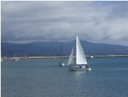
Pluto sailed in as the winner! Story and Photo by Clarke Simm