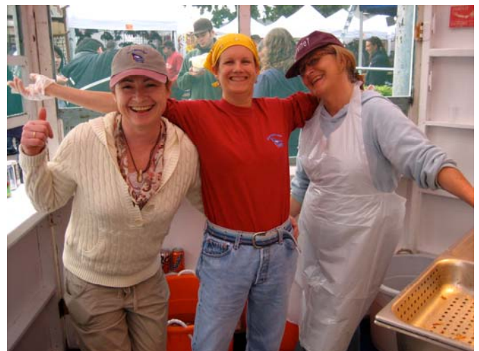
It has been rumored that those who work the Calamari Booth at Pumpkin Festival have way too much fun.