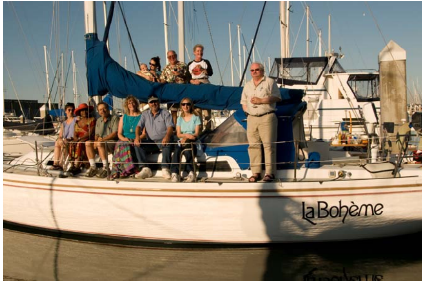
LA BOHEME and crew at South Beach Marina to attend San Francisco Opera at the Ball Park

Office Email: hmbyc@sbcglobal.net Office Phone: (650) 728-2120 Office Fax: (650) 728-1947 Club Phone & Messages: (650) 728-2120